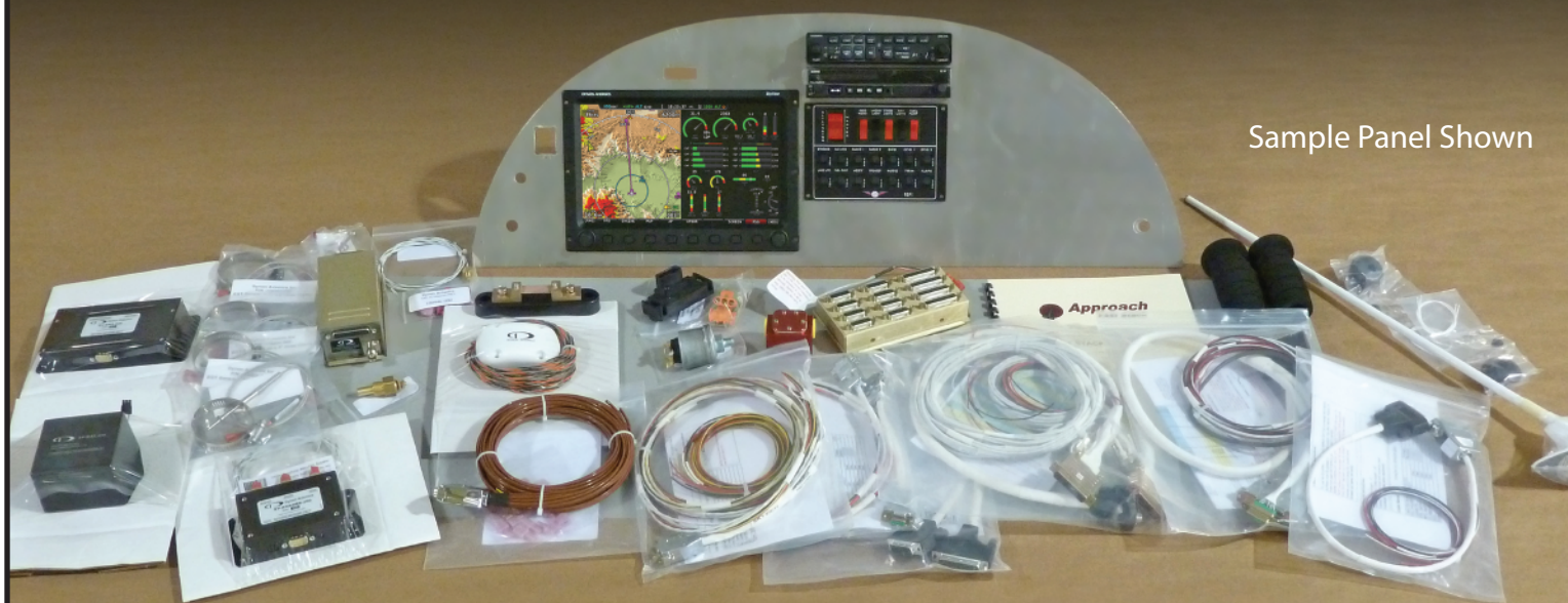
Sample Panel Shown

Zenith Aircraft Company supplies complete instrument panels and avionics kits to help Zenith builders complete their own instrument panels, with ease and simplicity of installation at an affordable price: